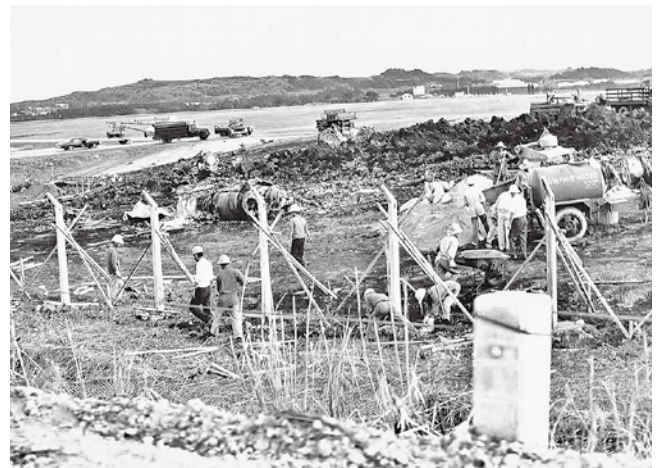
The B-52 Crash Site